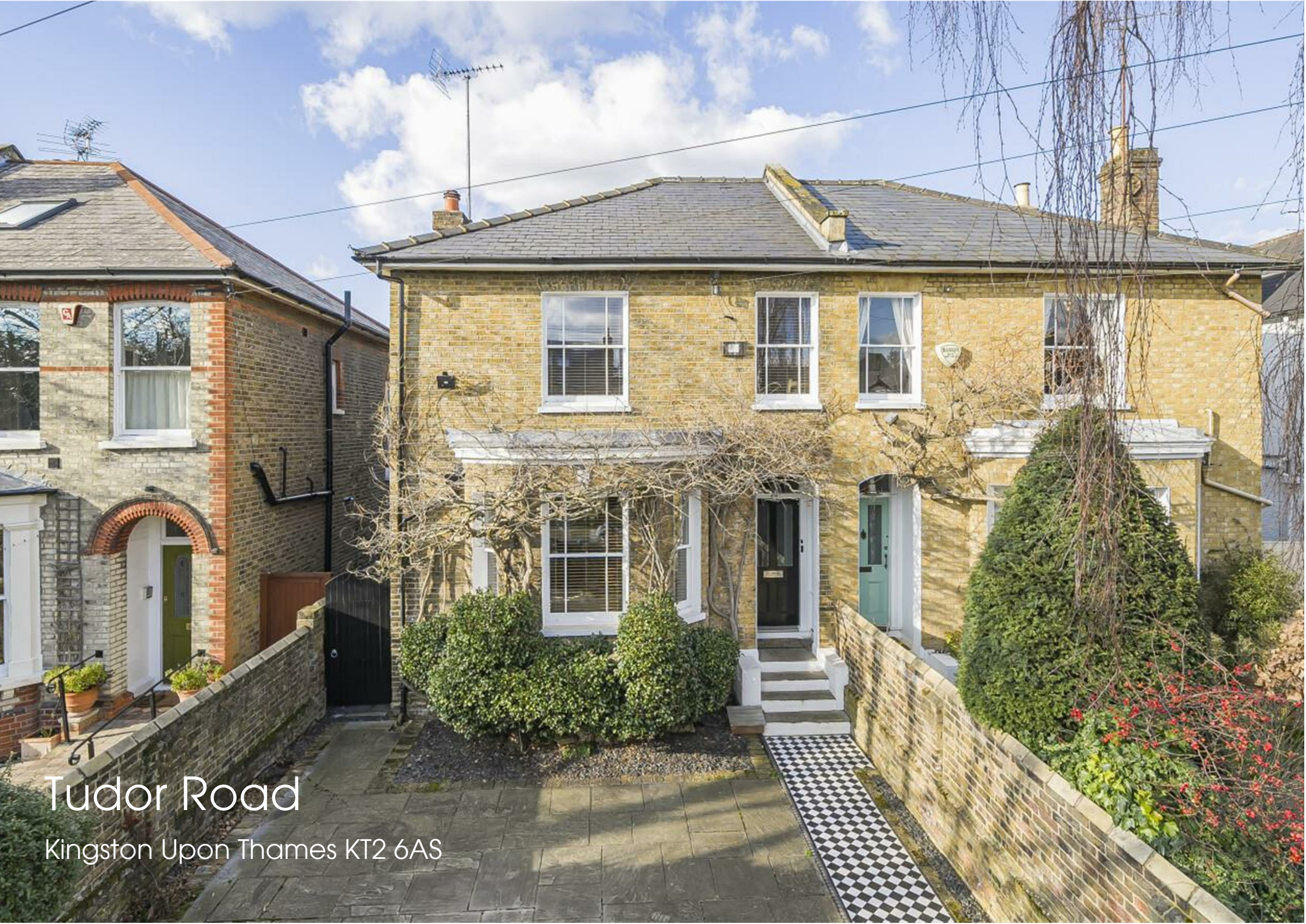
Tudor Road Kingston Upon Thames KT2 6AS

34 Richmond Road Kingston upon Thames Surrey KT2 5ED www.gibsonlane.co.uk Tel: 020 8546 5444